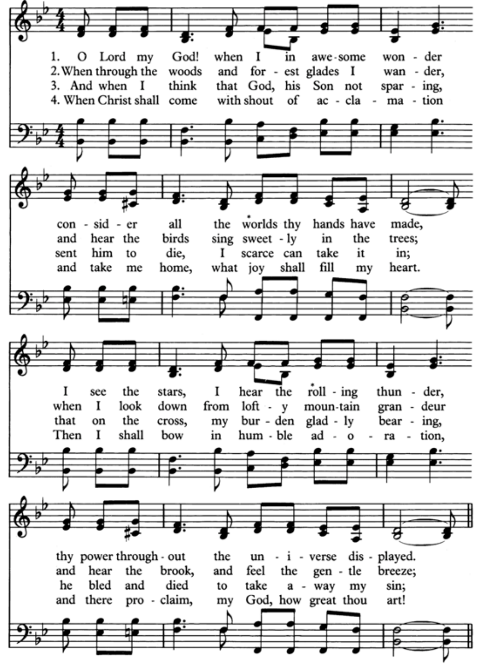
*Authors's original words are "works" and "mighty."